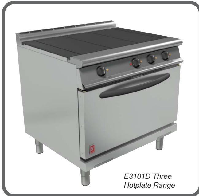
E3101D Three Hotplate Range